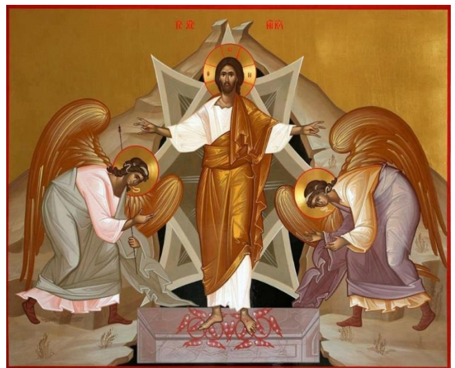
This image is licensed under CC BY-SA-NC .