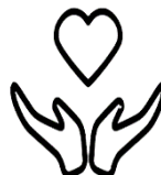
Service (hands that share)