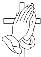
Faith (hearts in prayer)